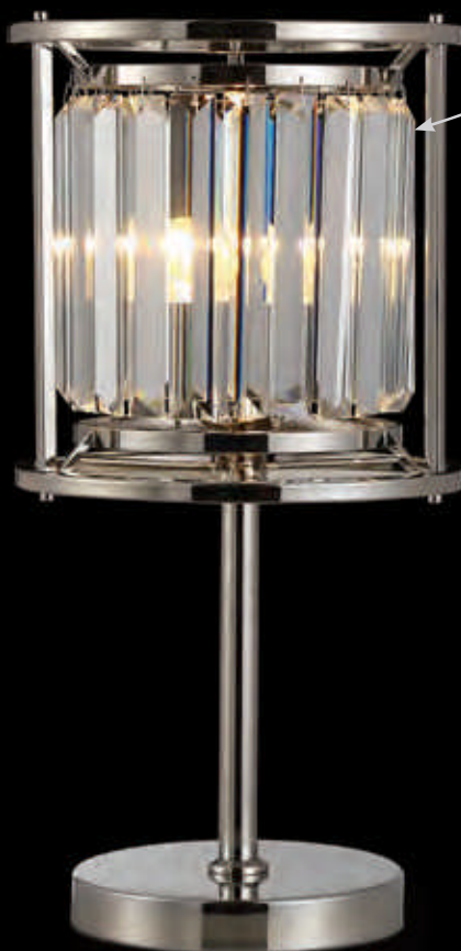
LMT9126 Ø 220 ↓ 432 (mm) 1 x E27 20W Polished Nickel/Clear