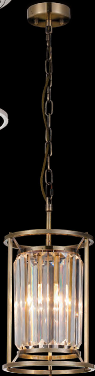
LMT9127 Ø 200 ↓ 370/470-1400 (mm) 1 x E27 20W Antique Brass/Clear