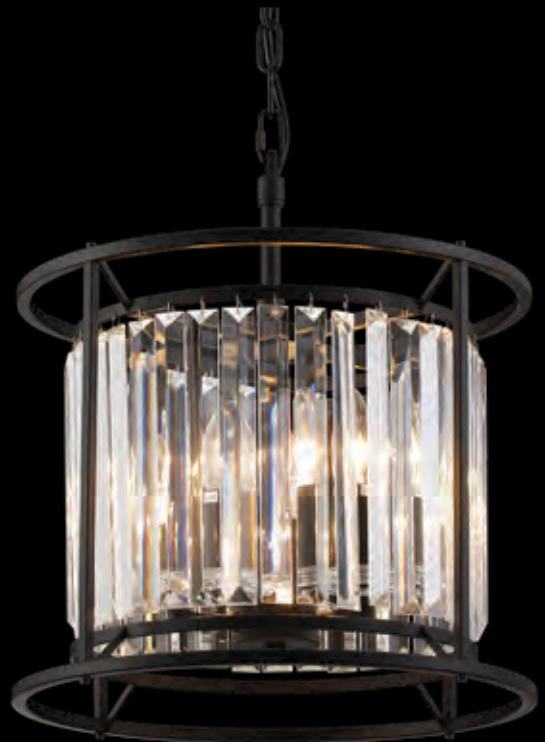
LMT9106 Ø 360 ↓ 380/480-1430 (mm) 3 x E14 20W Satin Black/Clear

lower carbon foot print: due to a smarter structural design that requires simple assembly, this collection has achieved a 35% reduction in packaging