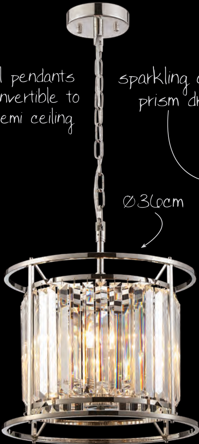
LMT9117 Ø 360 ↓ 380/480-1430 (mm) 3 x E14 20W Polished Nickel/Clear