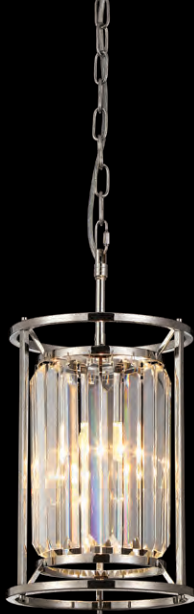
LMT9116 Ø 200 ↓ 370/470-1400 (mm) 1 x E27 20W Polished Nickel/Clear