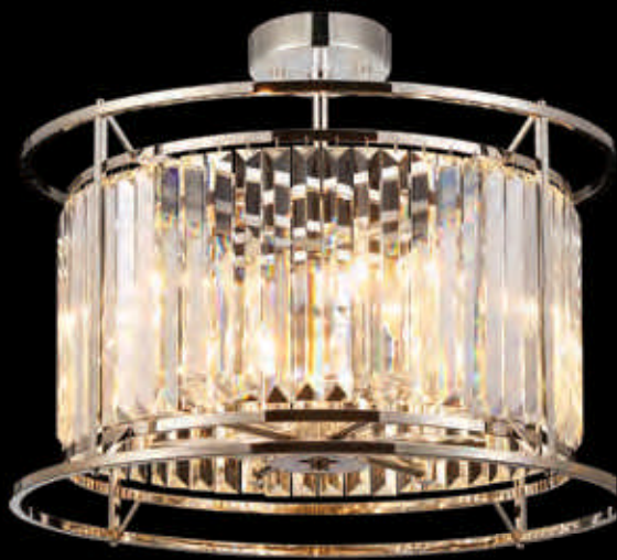
LMT9118 Ø 500 ↓ 380/480–1940 (mm) 6 x E14 20W Polished Nickel/Clear