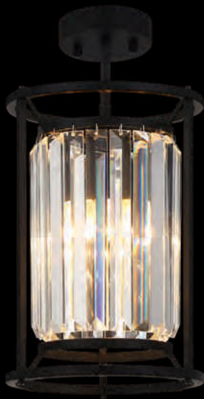
LMT9105 Ø 200 ↓ 370/470-1400 (mm) 1 x E27 20W Satin Black/Clear