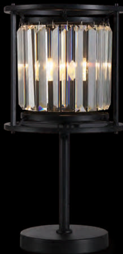
LMT9115 Ø 220 ↓ 432 (mm) 1 x E27 20W Satin Black/Clear