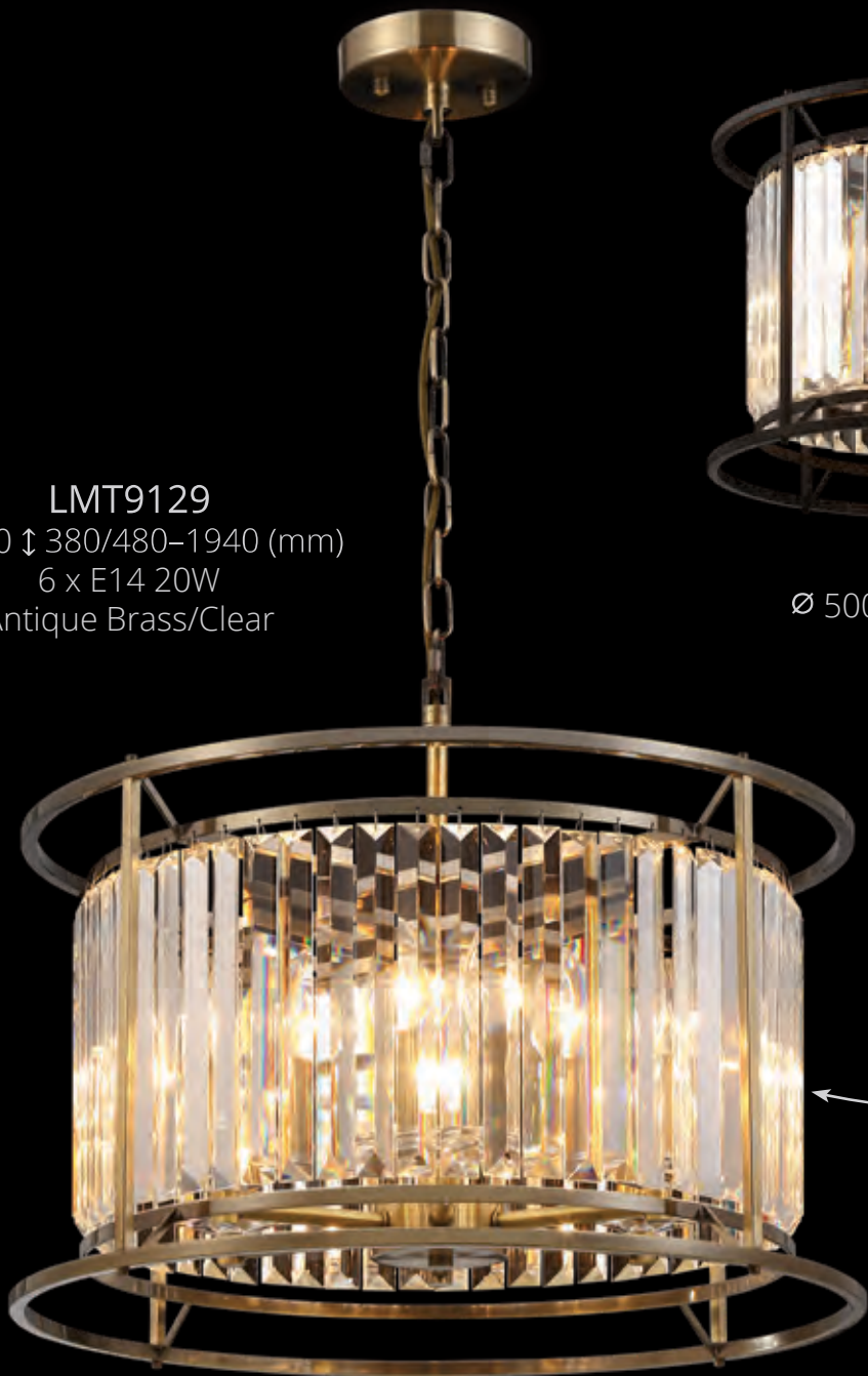
LMT9129 Ø 500 ↓ 380/480–1940 (mm) 6 x E14 20W Antique Brass/Clear