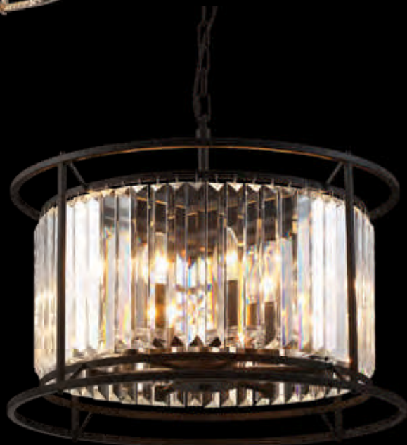
LMT9107 Ø 500 ↓ 380/480–1940 (mm) 6 x E14 20W Satin Black/Clear