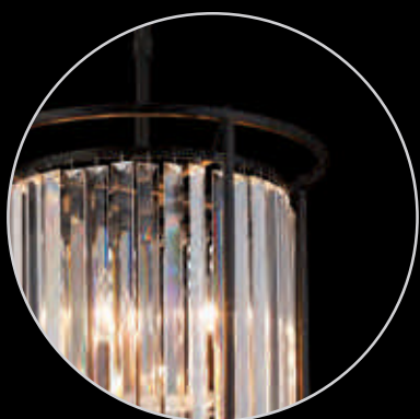
LMT9109 Satin Black/Clear