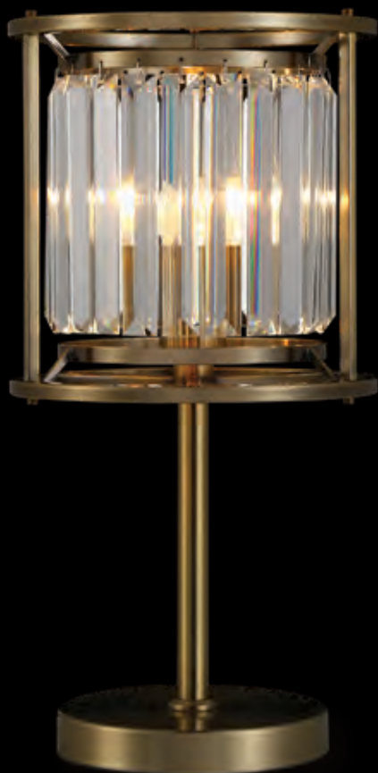
LMT9137 Ø 220 ↓ 432 (mm) 1 x E27 20W Antique Brass/Clear

impressive universal table lamps with crystal prisms