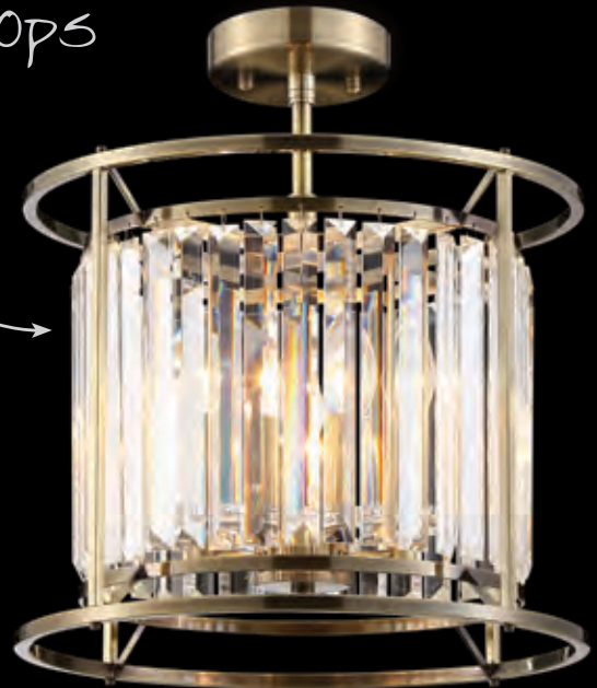
LMT9128 Ø 360 ↓ 380/480-1430 (mm) 3 x E14 20W Antique Brass/Clear