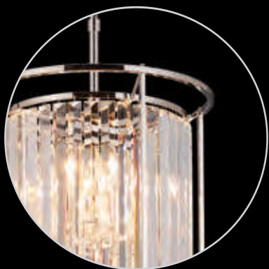
LMT9120 Polished Nickel/Clear