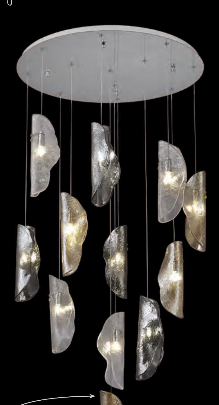
LMT9053 Ø 450 $ 310–2730 (mm) 6 x G9 10W Polished Chrome/Amber/Clear/Smoked

Range Characteristics: Handcrafted Glass Multiple Lamp Options Adjustable Height