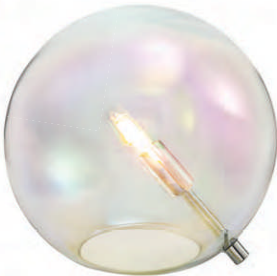
LMT8429 Ø 200 ↓ 200 (mm) 1 x G9 10W Polished Chrome/Iridescent