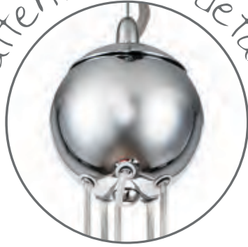
LMT8427 Ø 360 ↓ 1200-2100 (mm) 5 x G9 10W Polished Chrome/Iridescent