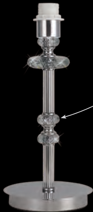
LMT8256 Ø 170 ↓ 370 (mm) 1 x E14 20W Polished Chrome