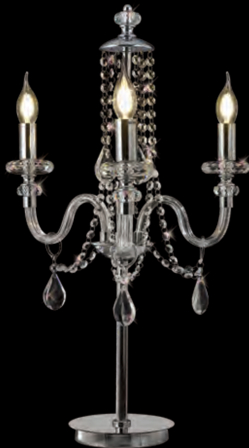
LMT8257 Ø 420 ↑ 680 (mm) 3 x E14 20W Polished Chrome

classical clear crystal range with glass arms