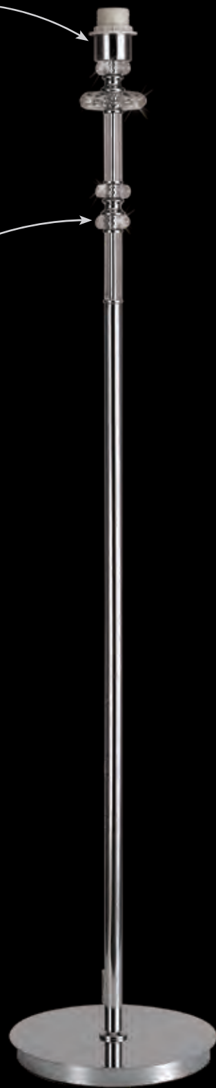
LMT8258 Ø 260 ↓ 1290 (mm) 1 x E27 20W Polished Chrome