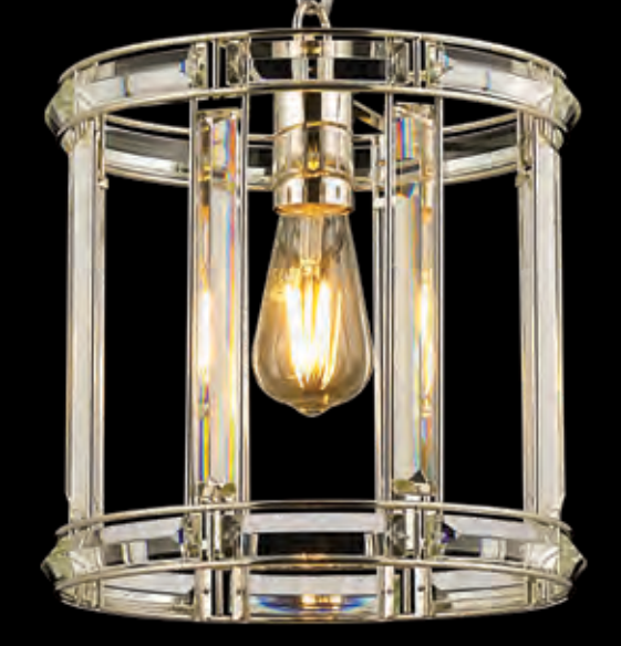
LMT9992 Ø 280 $ 410–1380 (mm) 1 x E27 20W Polished Nickel/Clear