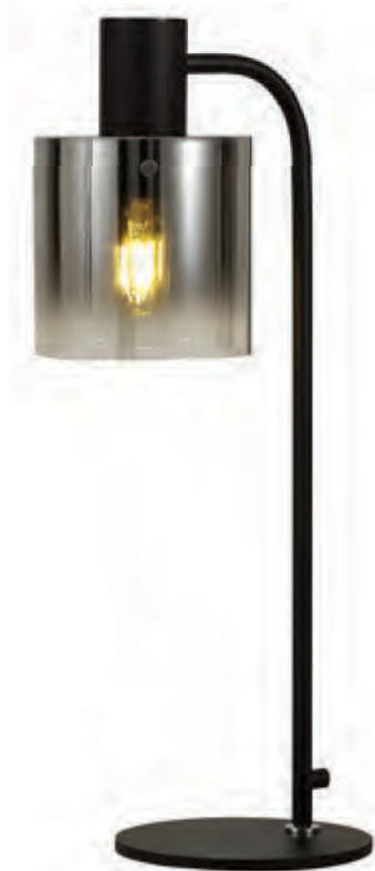
LMT9159 ↗ 180 ↓ 580 ↔ 230 (mm) 1 x E27 20W Black/Polished Chrome/Smoke Fade