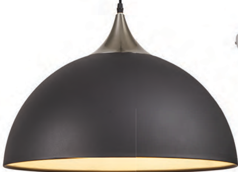
LMT8198 Ø 500 ↓ 445-1945 (mm) 1 x E27 20W Graphite/Satin Nickel