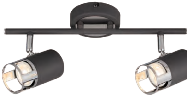
LMT9960 ↗ 100 ↕ 155 ↔ 400 (mm) 2 x GU10 10W Graphite/Polished Chrome

Range Characteristics: Contrasting Finishes 2 Colour Options Adjustable Spotlight Heads